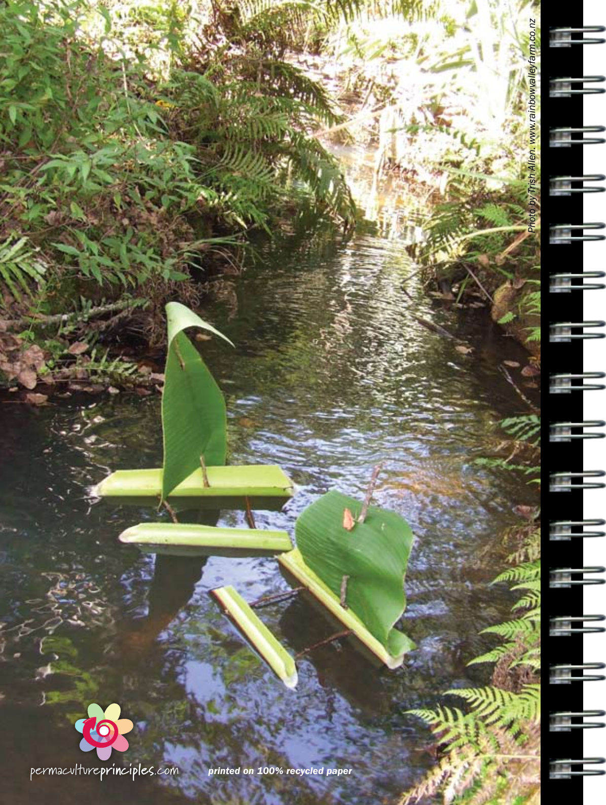
www.rainbowvalleyfarm.co.nz